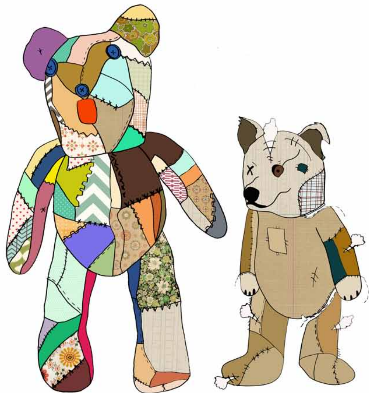
Patchwork is a hodgepodge, part patches, part bear. Patchwork's friend Fred is in need of repair.